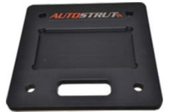
Base Stability Plate